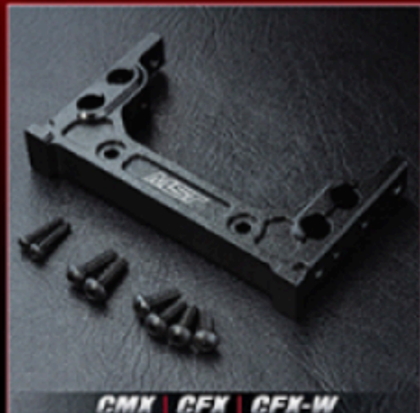
CMX Alum. crossmember A D CMX 鋁合金橫樑 A D