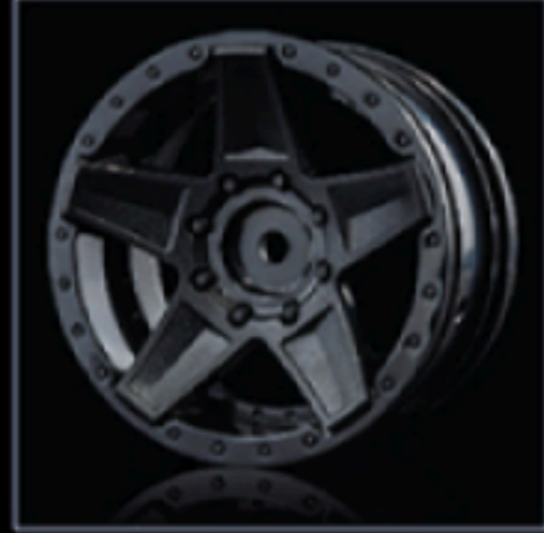
Black 648 1.9" wheel (+5) (4) 黑色 648 1.9" 輪框 (+5) (4)