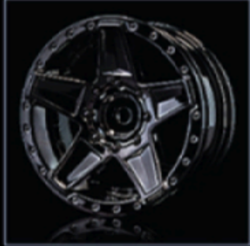
Silver black 648 1.9" wheel (+5) (4) 銀黑 648 1.9" 輪框 (+5) (4)