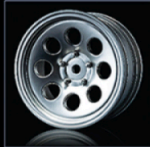
Flat silver 58H 1.9" crawler wheel (+5) (4) 消光銀 58H 1.9" 攀岩框 (+5) (4)