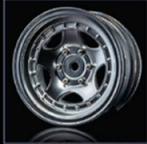
Flat silver 236 1.9" wheel (+5) (4) 消光銀 236 1.9" 輪框 (+5) (4)