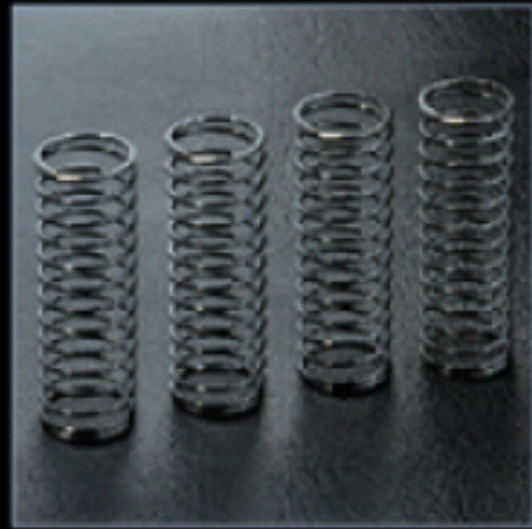
Coil spring 45mm (medium) (gold)(4) 避震彈簧 45mm (中)(金)(4)