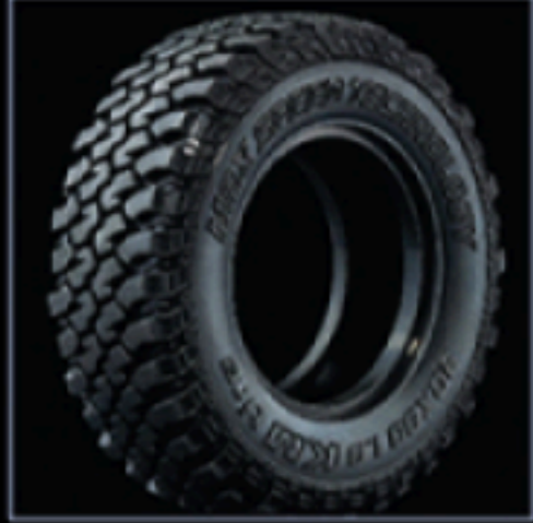
KM Crawler tire 30X90-1.9" (soft-30" (2) KM 攀岩胎 30X90-1.9" (軟-30") (2)