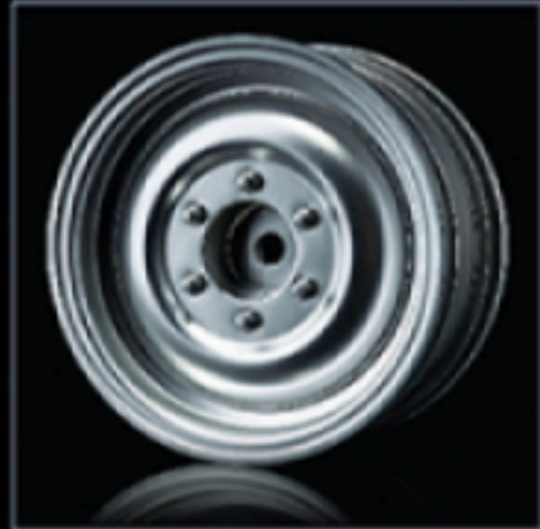
Flat silver 60D 1.9" crawler wheel (+5) (4) 消光銀 60D 1.9" 攀岩框 (+5) (4)