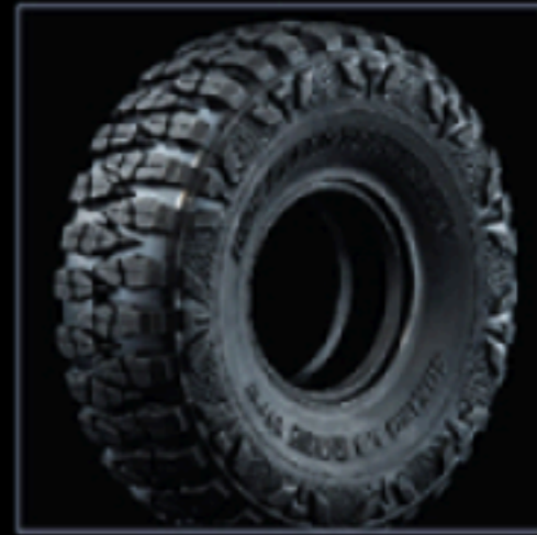
MG Crawler tire 40X120-1.9" (2) MG 攀岩胎 40X120-1.9" (2)