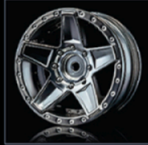
Flat silver 648 1.9" wheel (+5) (4) 消光銀 648 1.9" 輪框 (+5) (4)