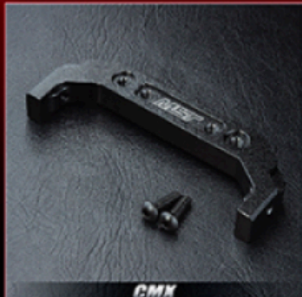
CMX Alum. crossmember B CMX 鋁合金橫樑 B