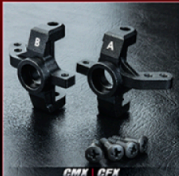
CMX Alum. knuckle (black) CMX 鋁合金轉向座 (黑)