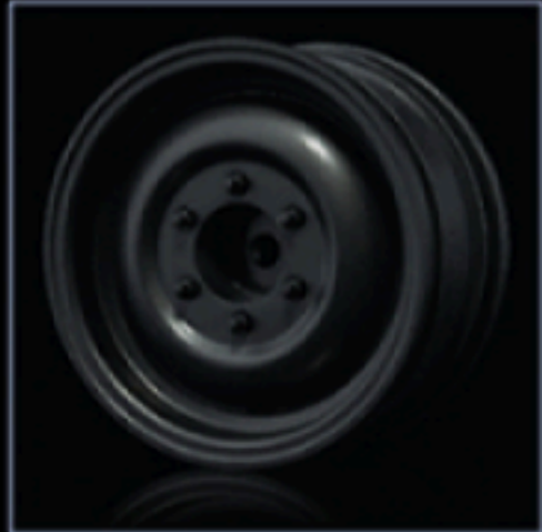
Black flat 60D 1.9" crawler wheel (+5) (4) 黑色消光 60D 1.9" 攀岩框 (+5) (4)