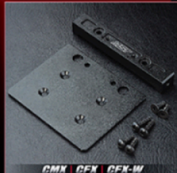
CMX Alum. crossmember C CMX 鋁合金橫樑 C