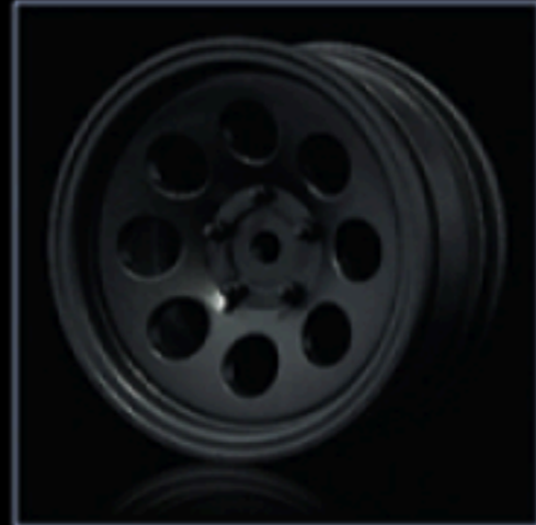
Black flat 58H 1.9" crawler wheel (+5) (4) 黑色消光 58H 1.9" 攀岩框 (+5) (4)