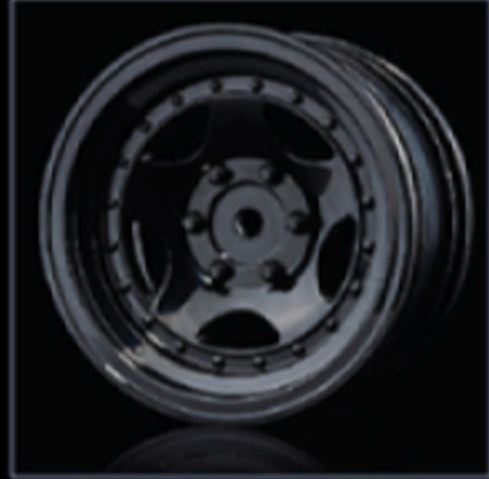
Black 236 1.9" wheel (+5) (4) 黑色 236 1.9" 輪框 (+5) (4)